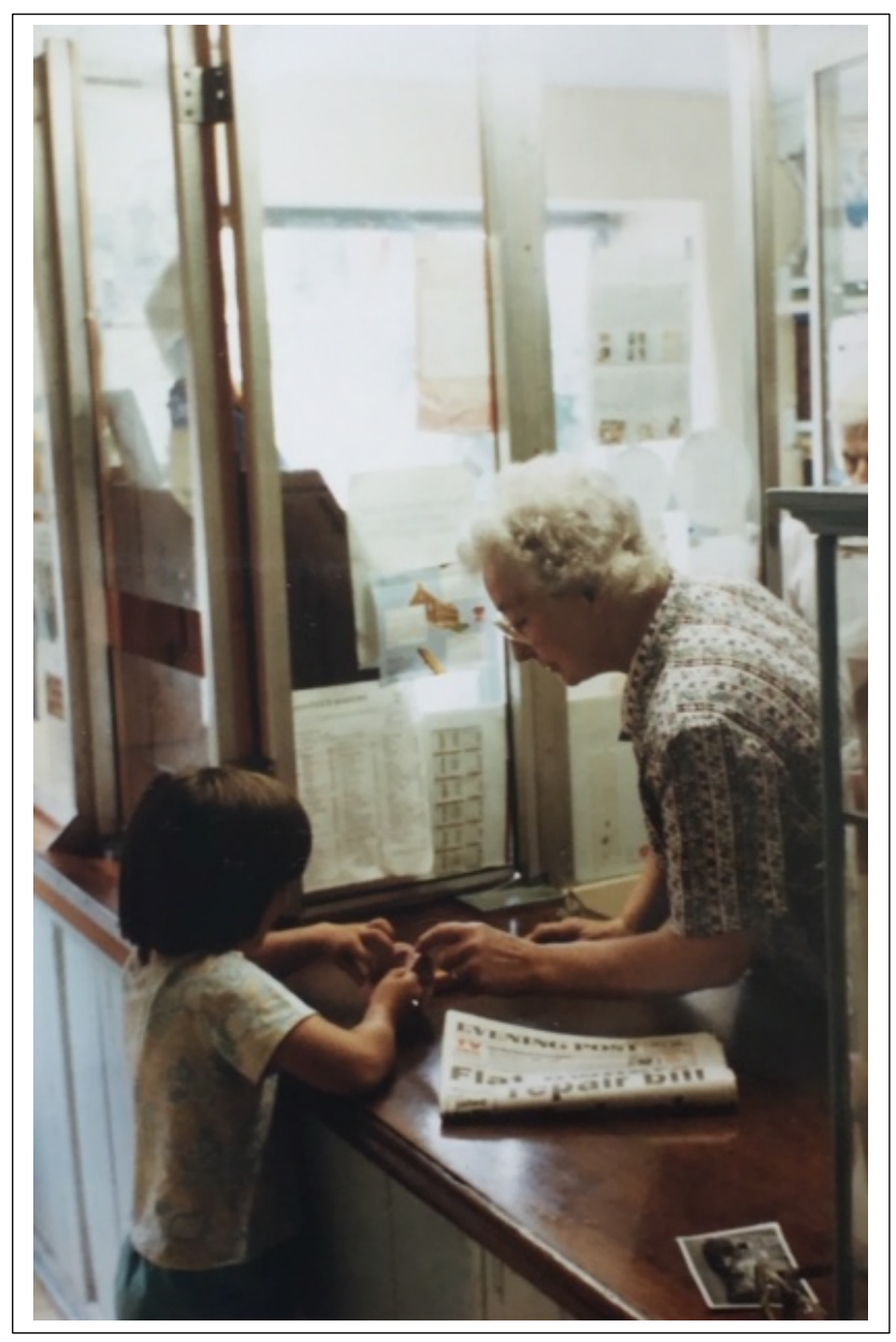
Fig 1.5. Doynton Post Office Counter, 1989.