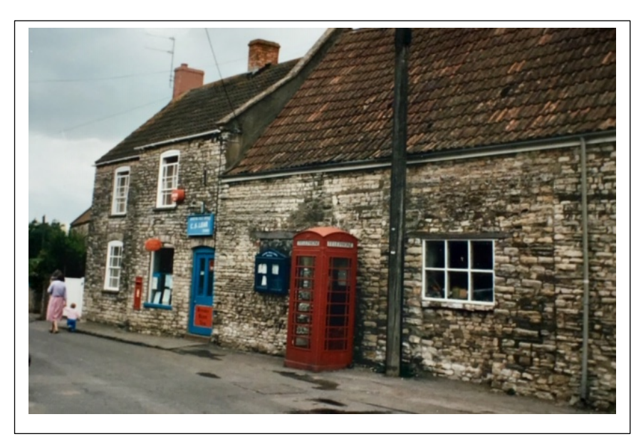
Fig 1.8. The Post Office Exterior, 1989.